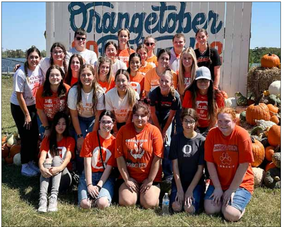
Orangefield High School FCCLA paired with Community Service to volunteer at the 3rd Annual Orangetober Festival! This event will be held October 6 - 8, 2023 at the Riverside Pavilion in Orange. The students set up pumpkin displays and organized photo opportunities. It is a great family event hosted by The City of Orange Convention & Visitors Bureau