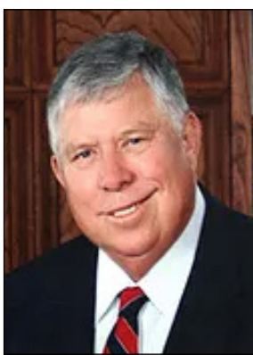
Former State Senator Carl Parker

Currently, a set of Republicans are hell bent on removing from libraries and schools any written materi-