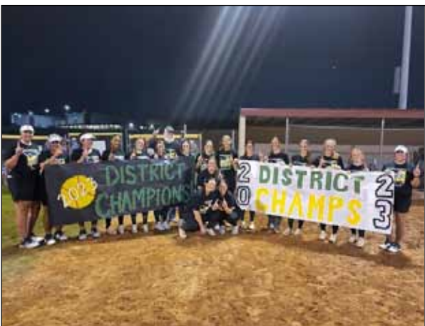
The Little Cypress Mauriceville Lady Bears celebrate their district softball championship after winning the clinching game at Silsbee. Lady Bears claim district title in softball.