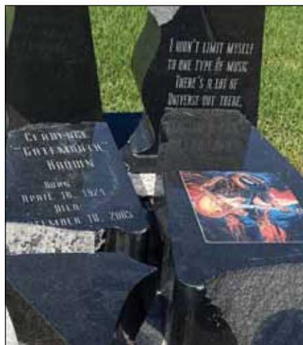
The original sculpted tombstone of Grammy-winning singer and musician Clarence 'Gatemouth' Brown in Orange's historic Hollywood Cemetery has been damaged by storms. Temporary repairs have not lasted, and now a musician and friend is leading an online effort for fans to get a new marker. mons Drive.

Brown's casket was among them. Authorities said it was pushed against a fence and never left the cemetery. He was quickly identified and reinterred.