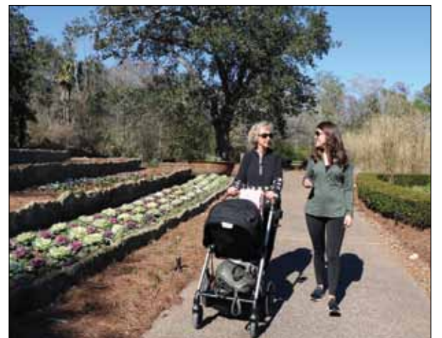
Shangri La Botanical Gardens and Nature Center invites the public to escape from the hustle and bustle of daily life and partake in their new health-focused program, Wellness Wednesdays. The gardens will open at 7 a.m. every Wednesday through October. Admission to Shangri La Botanical Gardens is free of charge.