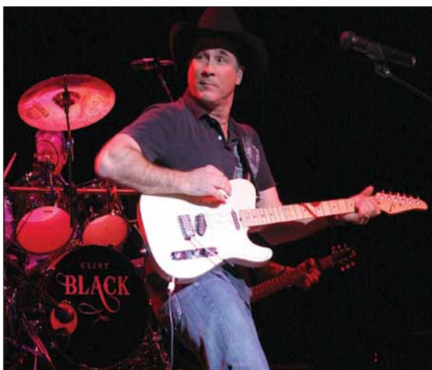
Country music star Clint Black is celebrating the 35th anniversary of his 1989 debut album, "Killin' Time," and will perform the album in its entirety on Saturday, Nov. 9 at L'Auberge Casino Resort in Lake Charles. Tickets start at $65 and are on sale now.