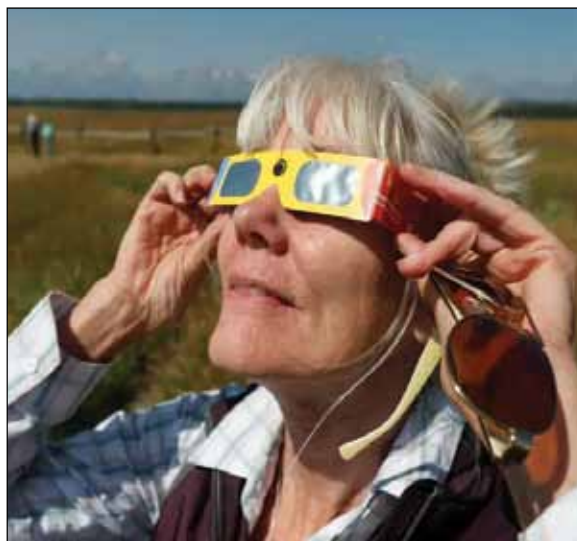
The upcoming solar eclipse will be the second within six months that is viewable from Texas, which will not see another solar eclipse for two decades. On April 8, the sun should appear to be about 93%-95% covered up to those in the SE Texas.

Houston or close to it, your view of the eclipse likely won't be as spectacular as it