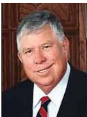
Former State Senator Carl Parker

There is a time and place for an area to benefit. The time is while the Legislature is in session. The place is various committees of the House and Senate. As an example, had I not been chair of the Senate Education Committee, there would not