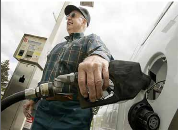
National average price of gas projected to see yearly decline in 2024 for second straight year.

to be $3.56-$4.04 per gallon on the holiday. "As 2023 fades away, I'm hopeful those $5 and $6 prices for gasoline and diesel will also fade into memory," said Patrick