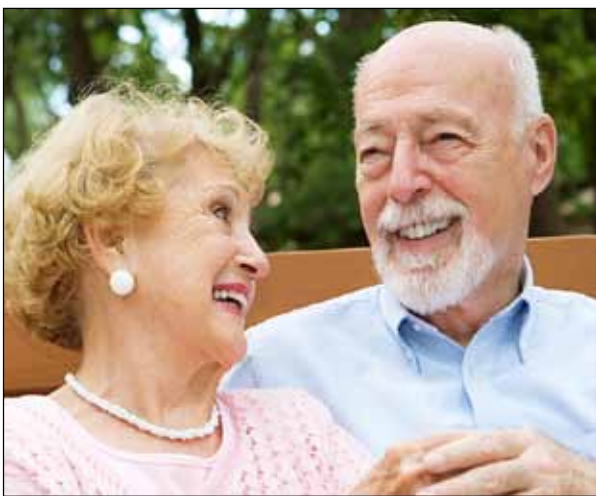
People who use hearing aids to restore hearing have a 24% lower risk of death, compared to people who don't use hearing aids, a new study finds.

This new study, which was published in The Lancet Healthy Longevity Wednesday, adds to the evidence of benefit. The findings do not prove that it's