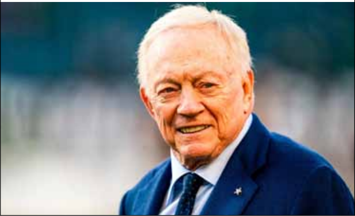
Owner and general manager Jerry Jones express his urgency about the team's desire to win.