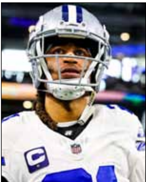
Dallas Cowboy cornerback Stephon Gilmore

ARLINGTON, Texas — The final score was 48-32 but, to be quite honest, it wasn't ever really that close of a contest between the Dallas Cowboys and the Green Bay Packers. The latter came out firing on all cylinders while the latter failed to get into gear time and again, and the Cowboys' season now ends in shocking fashion on Super Wild Card Weekend. Jordan Love looked like prime Aaron Rodgers at AT&T Stadium on Sunday, the Dallas defense having no answers for him or run-