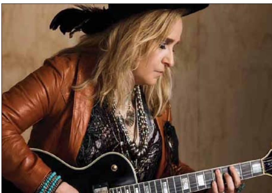
Melissa Etheridge will be performing at the Golden Nugget Casino on April 19. Meanwhile, ZZ Top, Lynard Skynyrd and Black Stone Cherry will be appearing at the Cajun Dome in Lafayette, La.