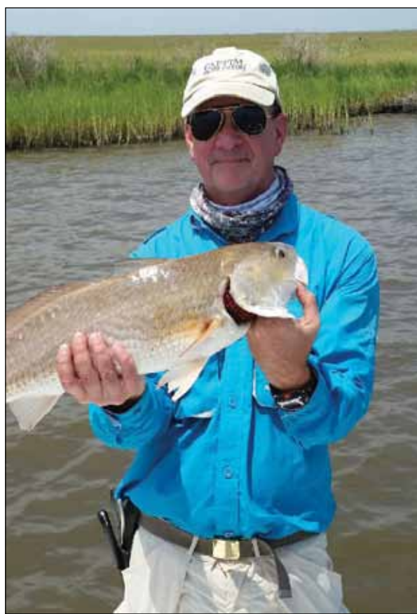
Slot redfish, smaller sized trout, and drum can be caught in the Intracoastal canal on live shrimp under popping cork.

Redfish are along the shorelines. Moving water is the key and redfish are eating live shrimp under a popping cork and WACKy shad xl Showtime color. Trout are staging on reefs later in the day and showing up on the flats early being caught on rollover moon WAC Assassins. Drum and sheepshead are mixed in with the redfish. Flounder are making a comeback in points and the mouths of creeks. White twitch baits and white gulp shrimp are hitting well on a 1/4 ounce jig head. Pay attention to wind and weather and stay on a protected shoreline when necessary. Report by